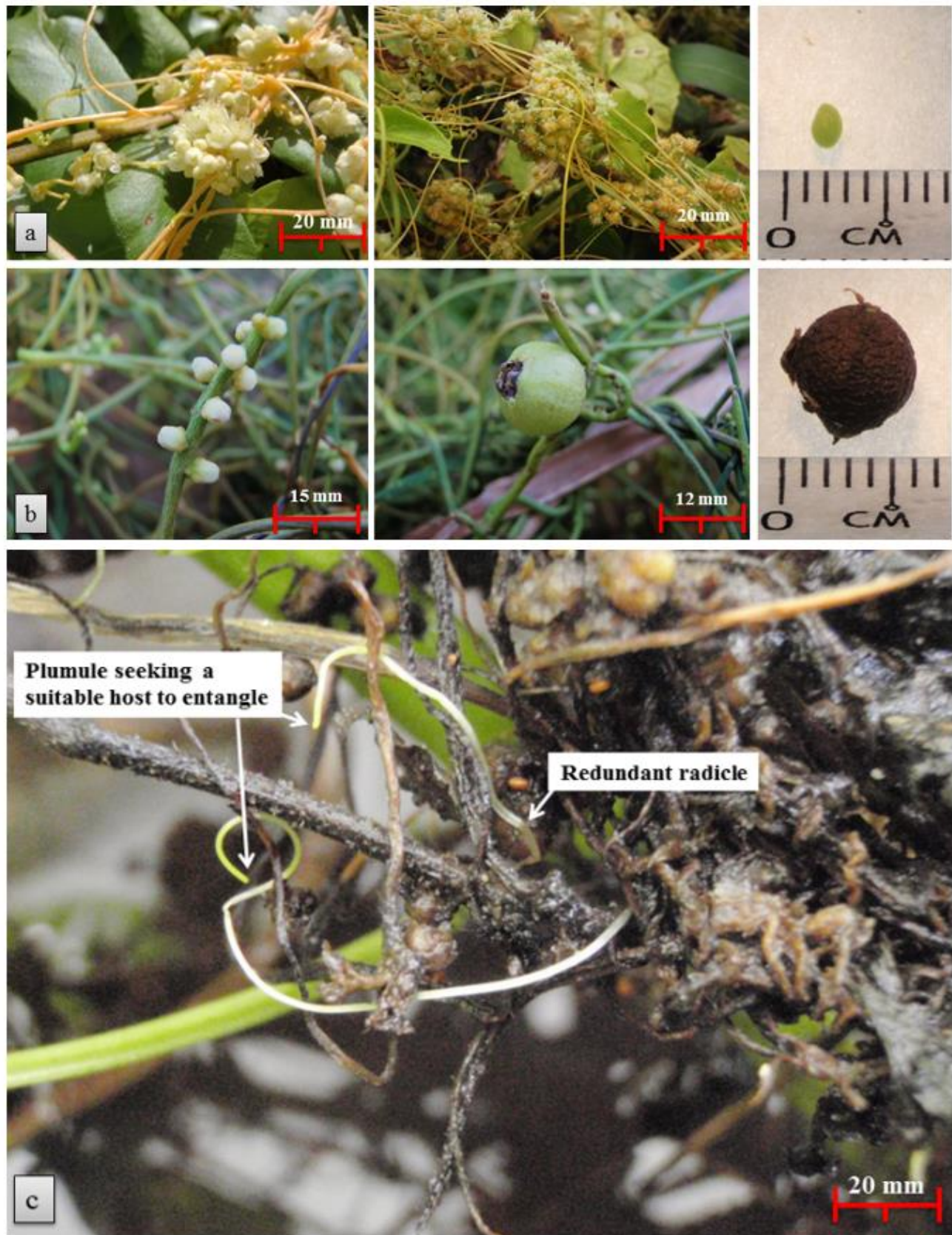
Figure 2. Distinguishable flower, fruit and seed characters of (a) Cuscuta spp., (b) Cassytha filiformis and (c) Geminating Cuscuta seeds – note the lack of development of radicle and the elongating plumule in search of a suitable host plant for immediate attachment.