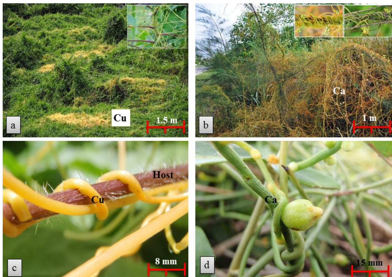
Figure 1. General habit of (a) Cuscuta (Cu) and (b) Cassytha (Ca) parasitizing host plants. One of the most convenient methods of correct identification of these two species showing parallelism in the field is by close examination of the vegetative body. Stem appearance of Cuscuta is smooth (c), while Cassytha has a coarse stem due to the presence of waxy plates (d).

have smooth, shiny appearance whereas Cassytha spp. have coarse and ridged stems due to the presence of numerous waxy plates as shown in Figure 1c and Figure 1d . When stems are crushed, while Cuscuta is generally odourless, most Cassytha spp. release a pungent odour due to the presence of a range of essential oils, which is a characteristic feature of family Lauraceae.