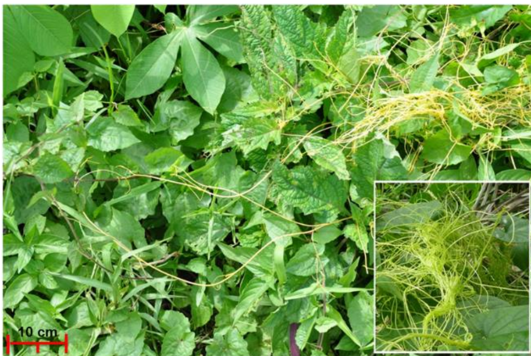
Figure 4. Nastic movement of Cuscuta stems in search of potential hosts; (inset) Young vegetative stems of Cuscuta inadvertently entangling among themselves when foraging towards the preferred host plants for establishing successful parasitic connections via numerous haustoria.

Field observations have revealed that dodders appear mostly along the banks of streams, degraded watersheds and wastelands while woe vines distribute mainly in coastal vegetation. Dodders also grow at a much faster rate than woe vines in search of host plants. 9 It was reported that dodders usually make the attachments with hosts within 3 days upon germination. The movement of parasite stem is from side to side to facilitate contact with vertically growing hosts.