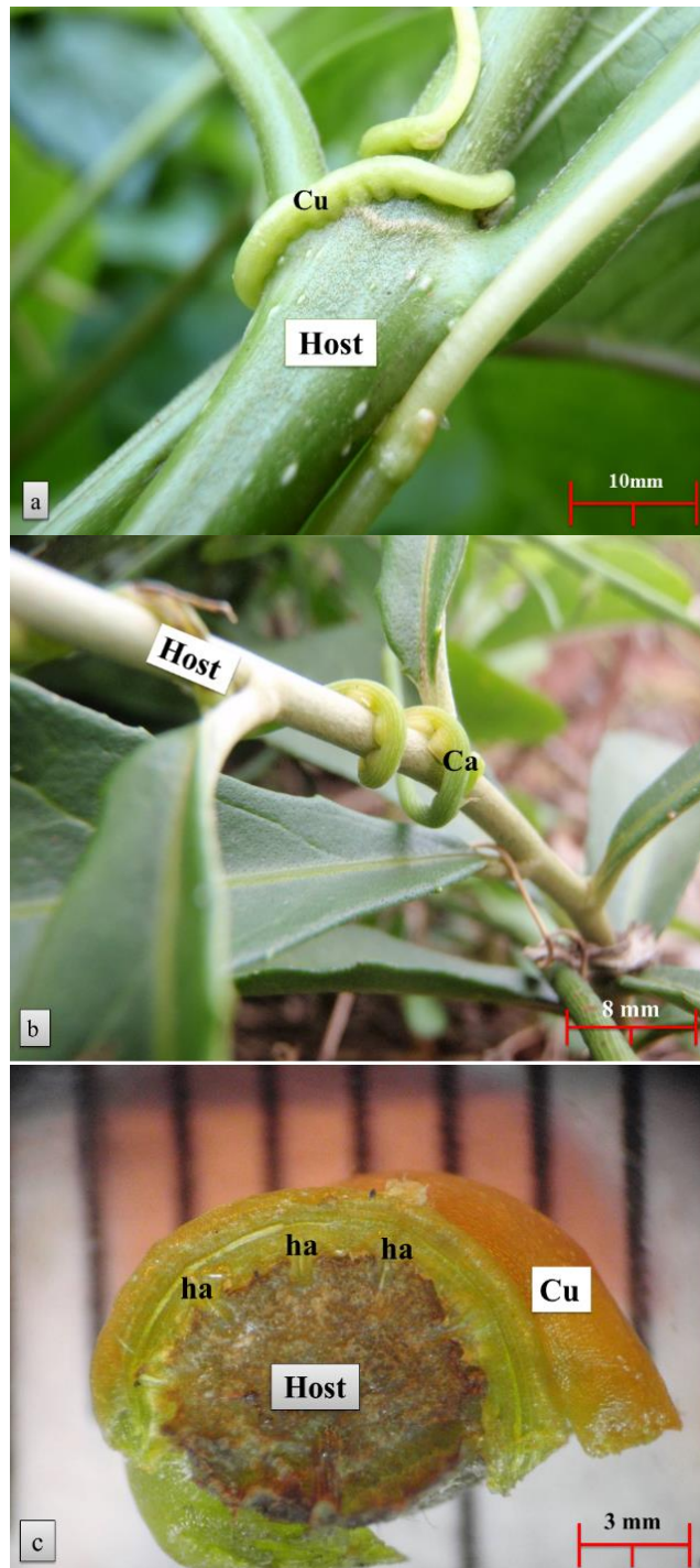
Figure 5. Successful haustorial establishment of (a) Cuscuta (Cu) and (b) Cassytha (Ca). (c) Longitudinal sections at the haustorial interface clearly show the orderly tissue contacts made by the haustorium (ha) to tap nutrients and waters from the host vascular tissue.

(from absorbing hyphae abutting host phloem sieve tubes) tissues of host. 17,18